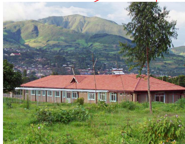
In addition to the breadth of clinical experiences available in an Ethiopian region where more than three-million people have limited access to healthcare, the rotations at Soddo Hospital (pictured) will present stimulating prospects for research in such areas as outcomes, public health, provision of treatment in resource-poor surgical environments, and advanced and unusual disease states.